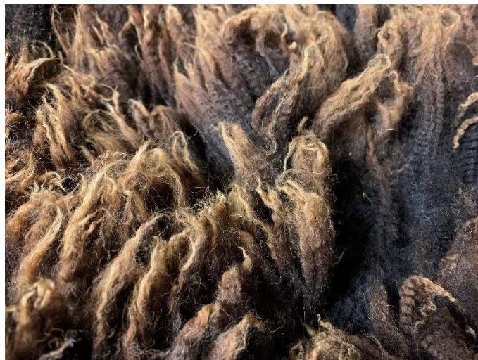
Above: view of front quarter of Sheba's fleece.