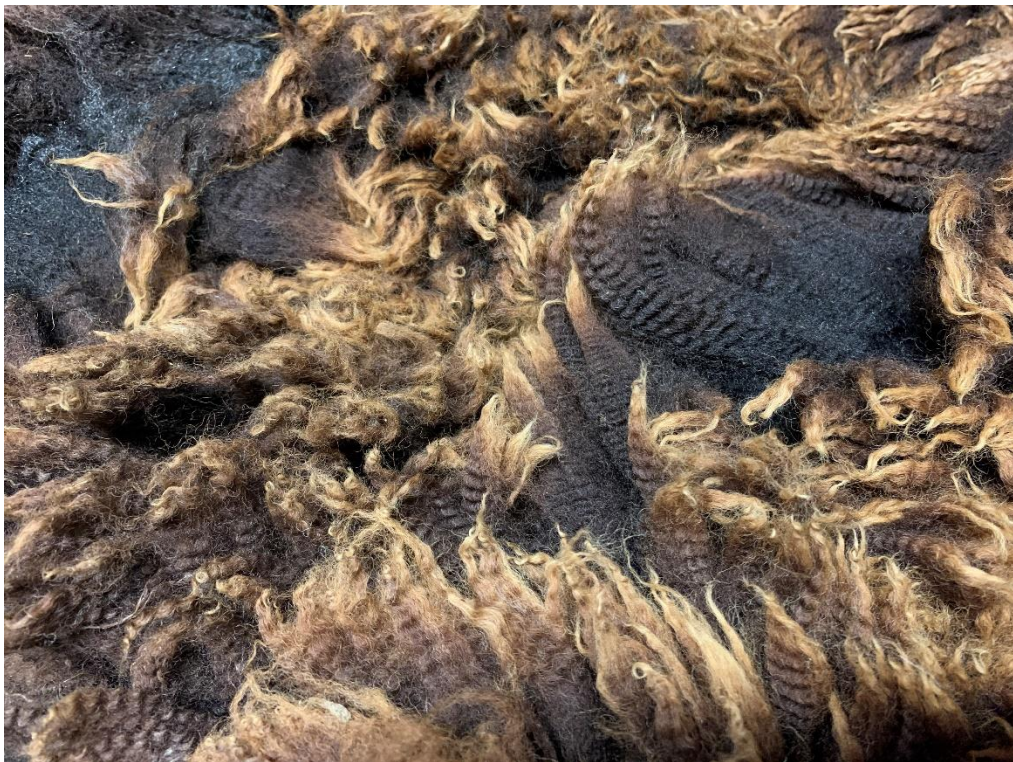
Above: view of rear quarter of Sheba's fleece (Continued on next page)