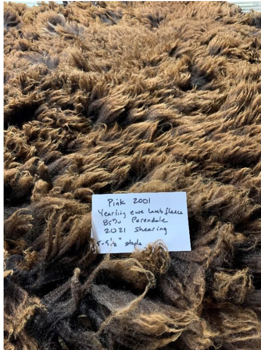
Above: overview of Sheba's fleece, from head towards rear quarters.

Sheba was so named because right from the moment of birth, she felt she was destined to rule the world. She's not one bit afraid to stamp her feet at my dogs when they're trying to encourage the yearlings to move away from the hay feeder and onto pasture. Sheba's fleece tested at a 39.6 micron count, consistent with its bolder than average crimp. It is probably my "cleanest" fleece, in part because it's so "thick" that it's hard for anything to penetrate. Sheba's fleece weighs 6.8 pounds skirted. It is a very dark gray, just a tiny shade lighter than Nocturne's.