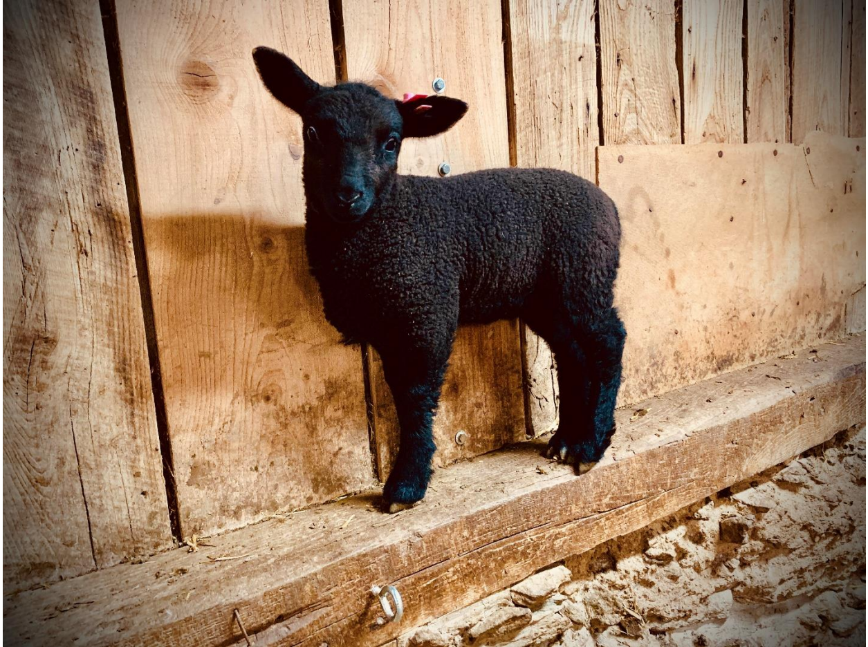
The Queen of Sheba herself, as a week-old lamb.