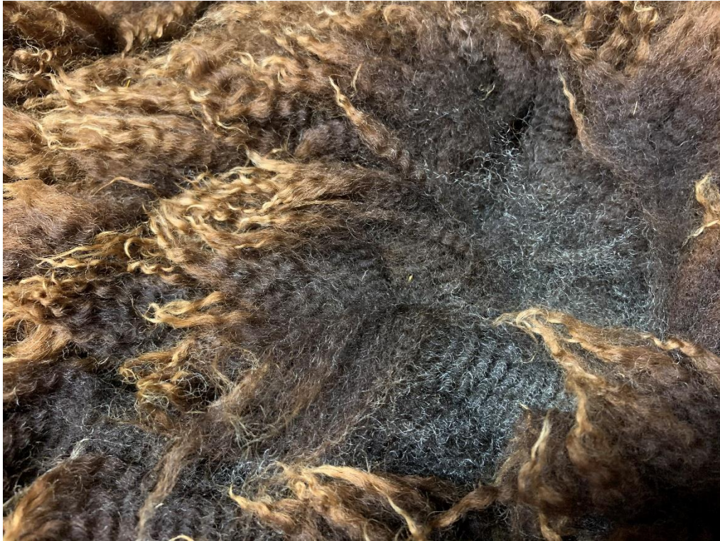
Above: view of middle of Sheba's fleece