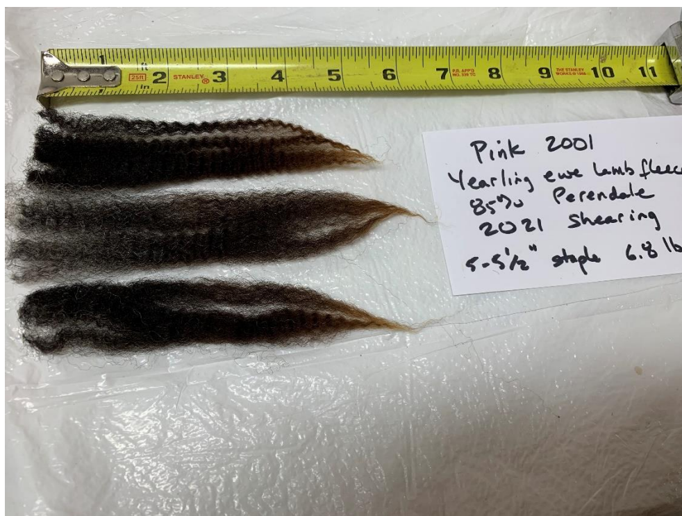
Same three locks after brief washing in tepid water with goat's milk soap. (Continued on next page)