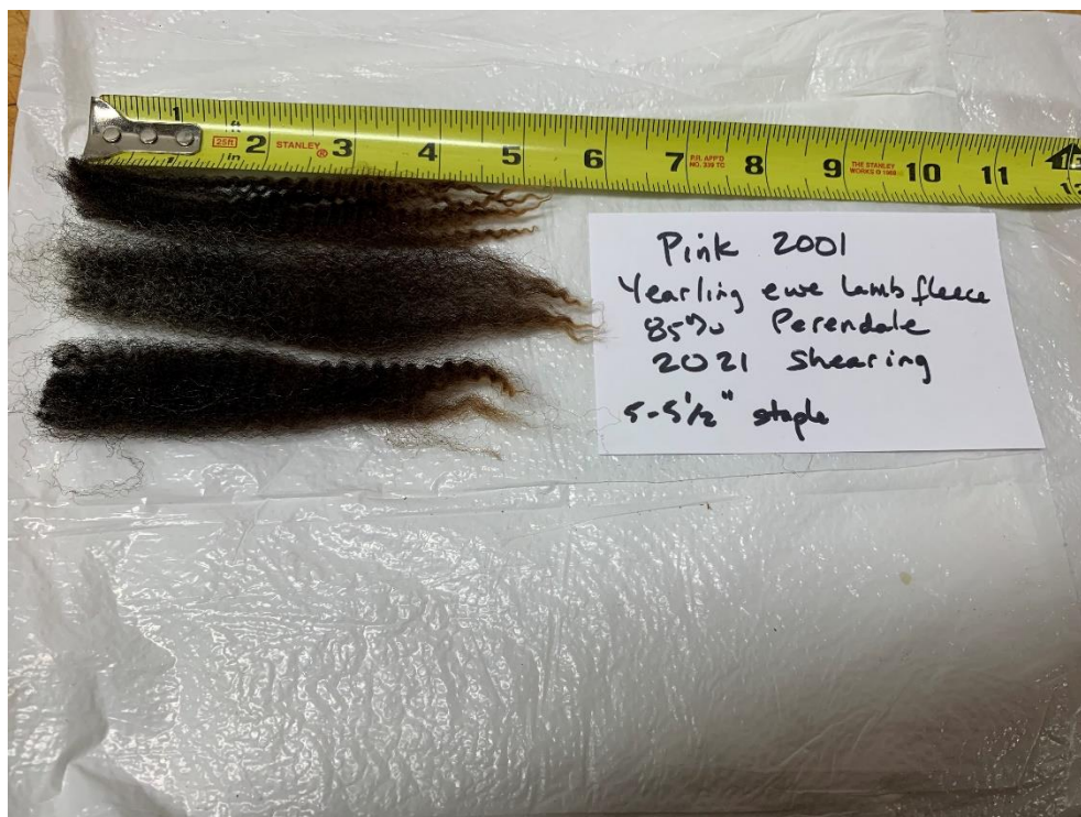
Above: three locks of Sheba's fleece, taken at random from (top to bottom) front, middle, and rear quarters. All locks tested sound.