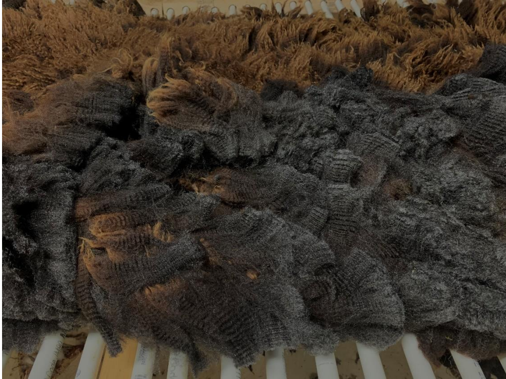
Cut side of Sheba's fleece