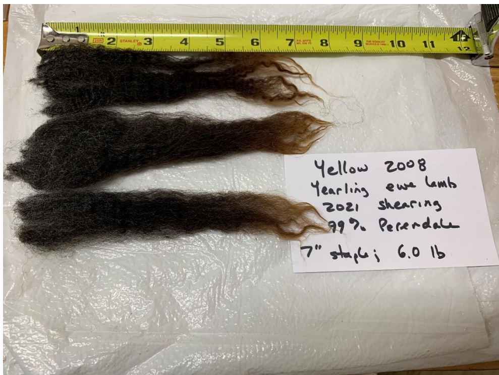
Same three locks after brief washing in tepid water with goat's milk soap. (Continued on next page)