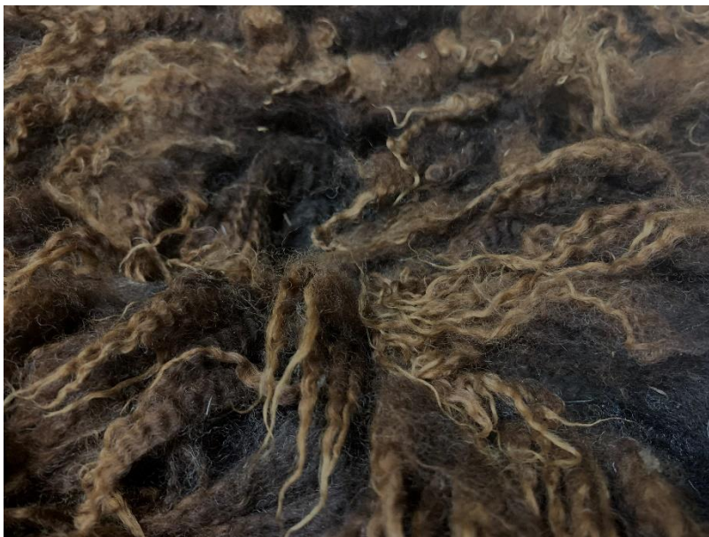
Above: view of front quarter of Nocturne's fleece. (Continued on next page)