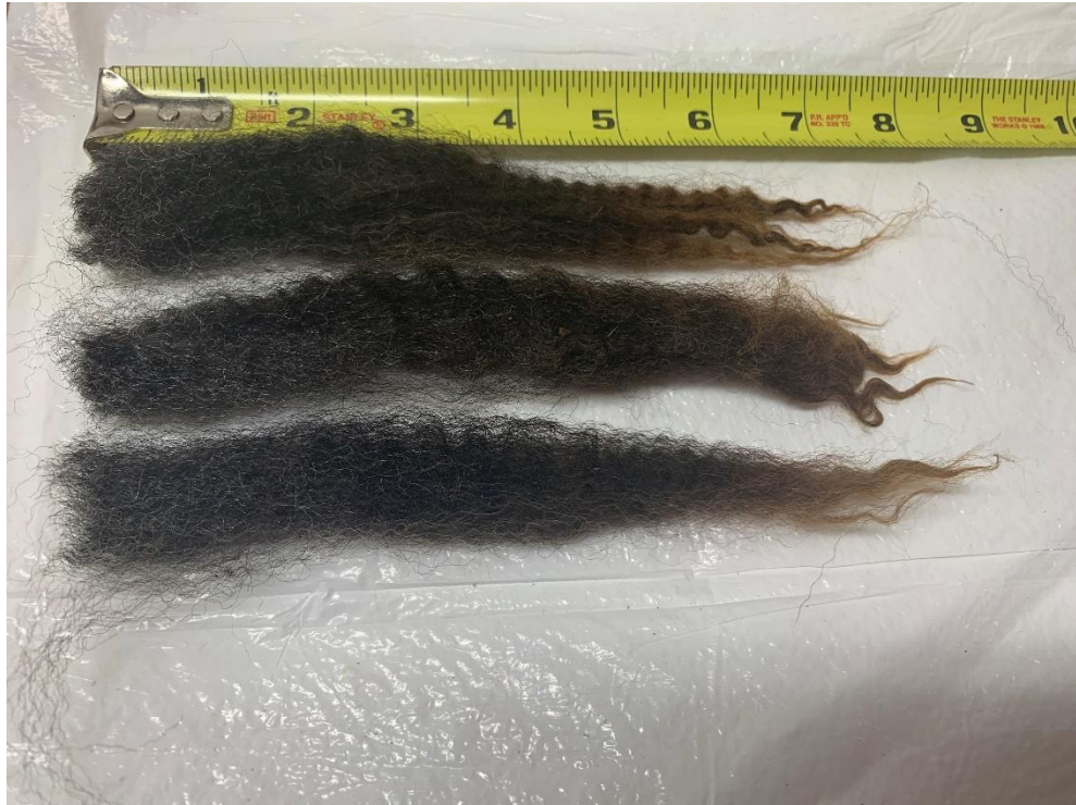
Above: three locks of Nocturne's fleece, taken at random from (top to bottom) front, middle, and rear quarters. All locks tested sound.