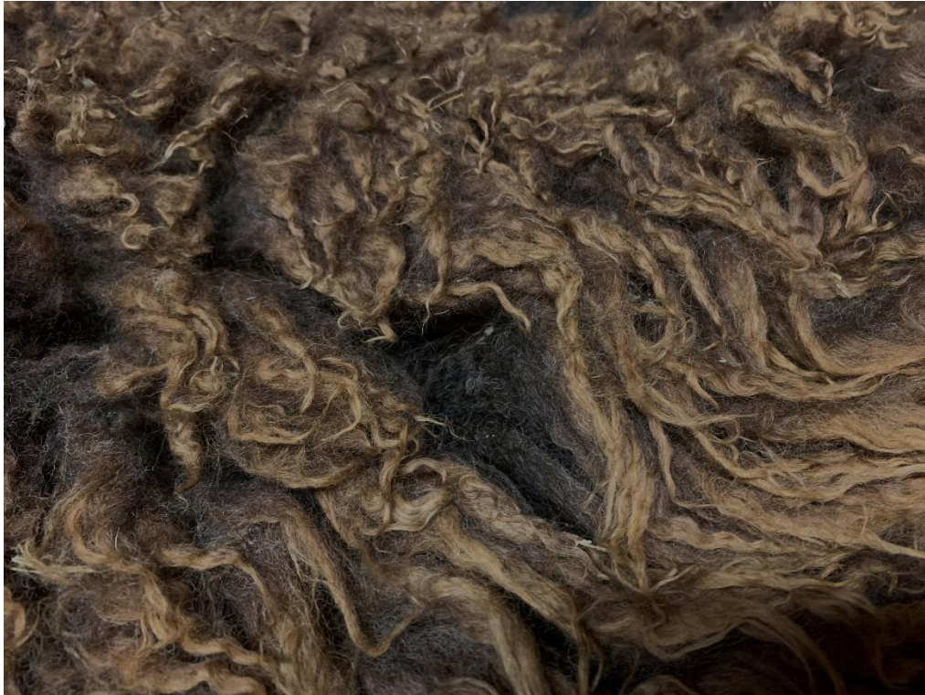
Above: view of middle of Nocturne's fleece