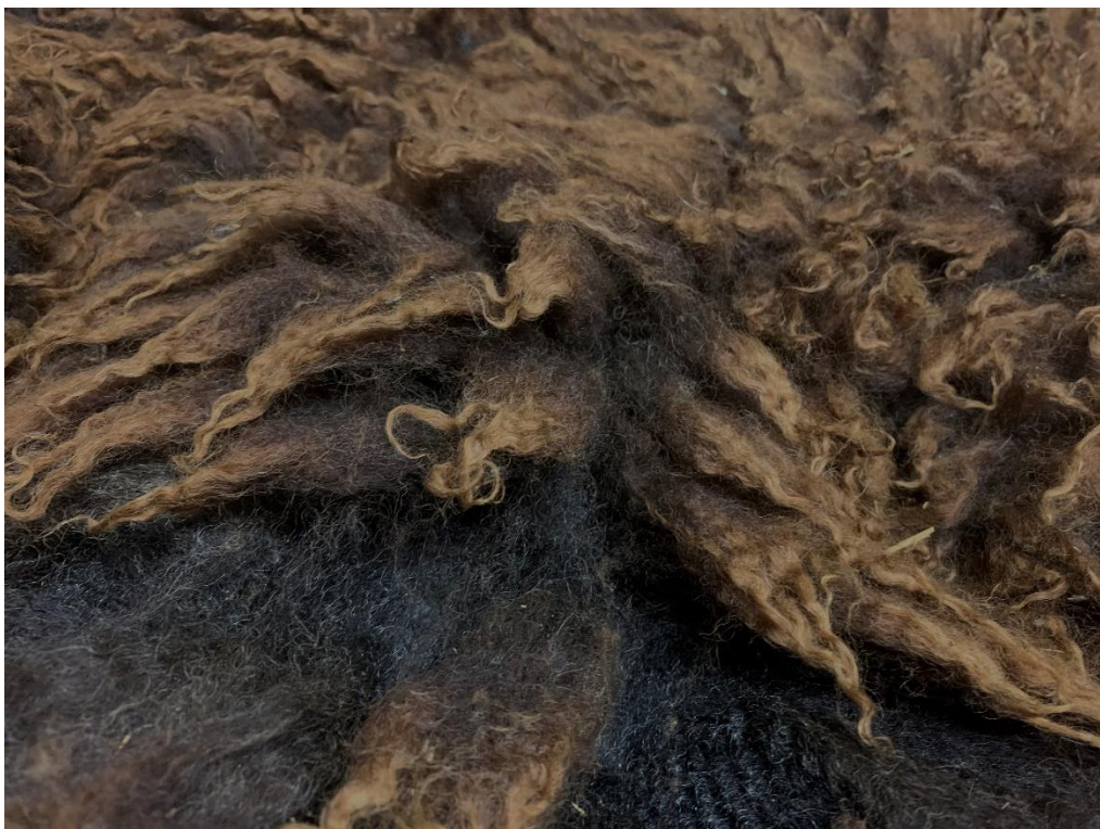
Above: view of rear quarter of Nocturne's fleece (Continued on next page)