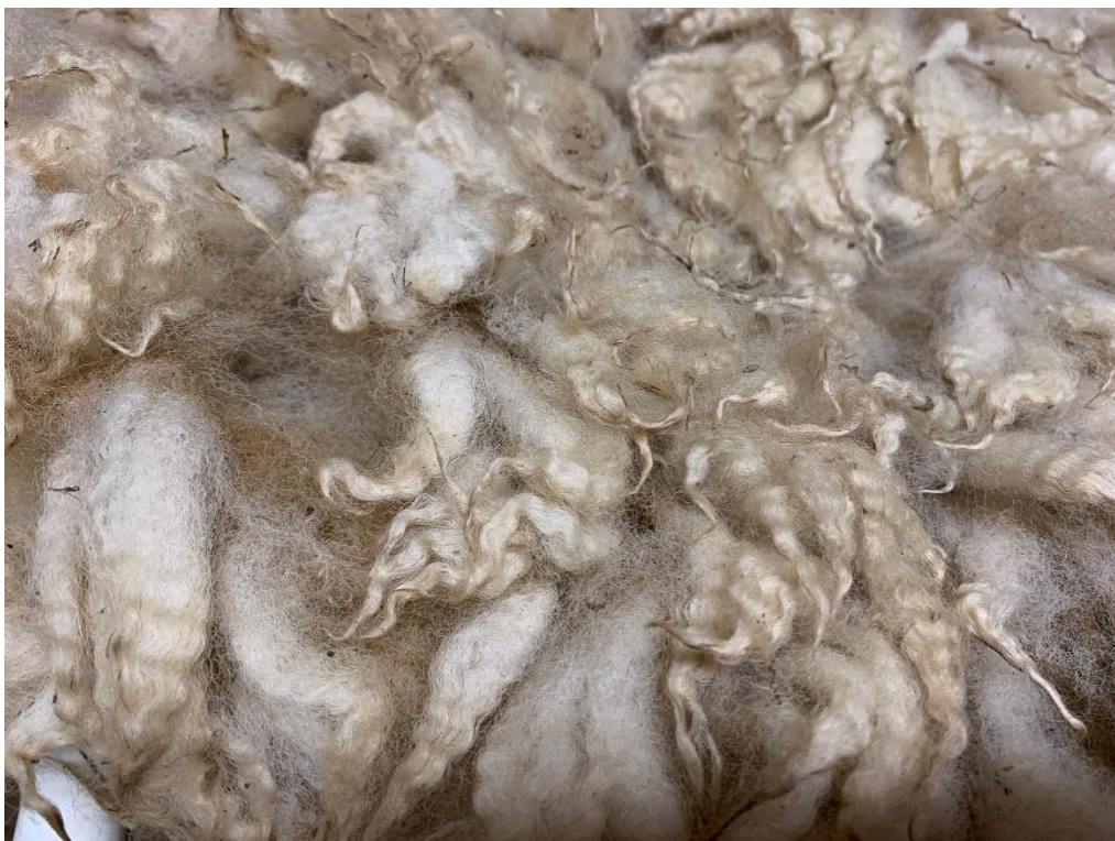
Above: view of rear quarter of Bianca's fleece (Continued on next page)