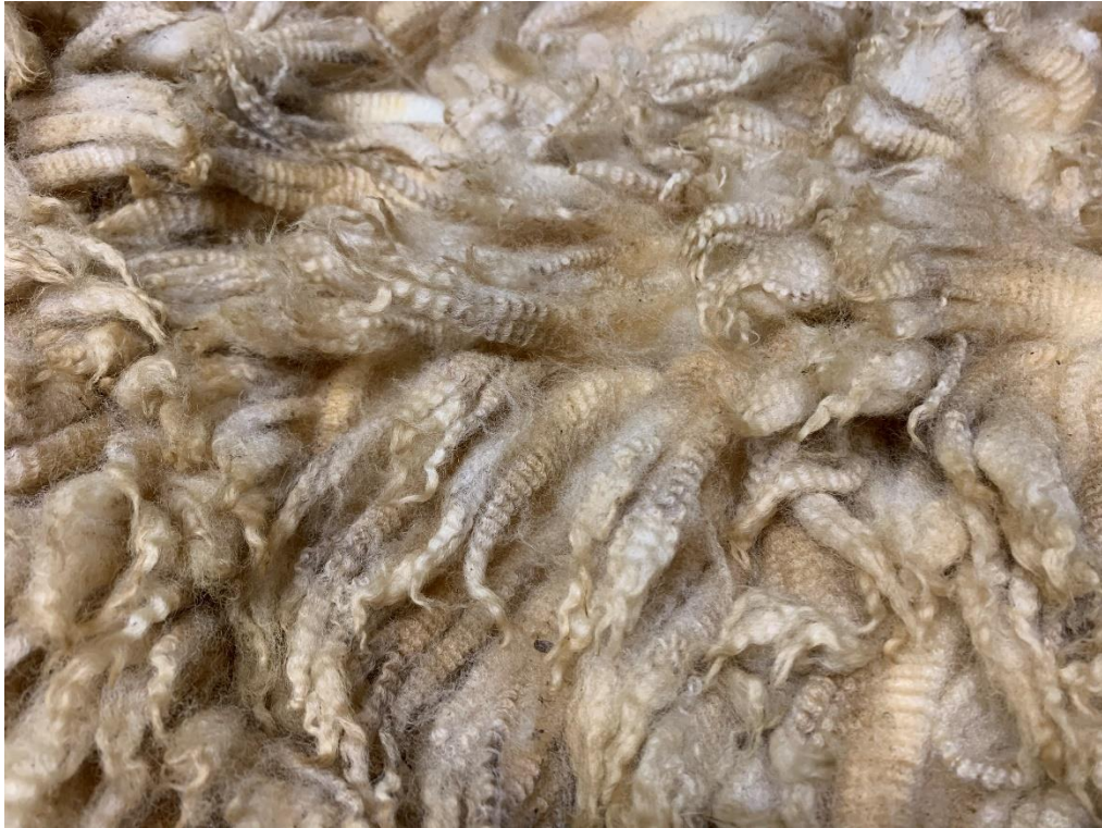
Above: view of middle of Bianca's fleece