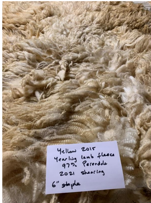
Above: overview of Bianca’s fleece, from head towards rear quarters.