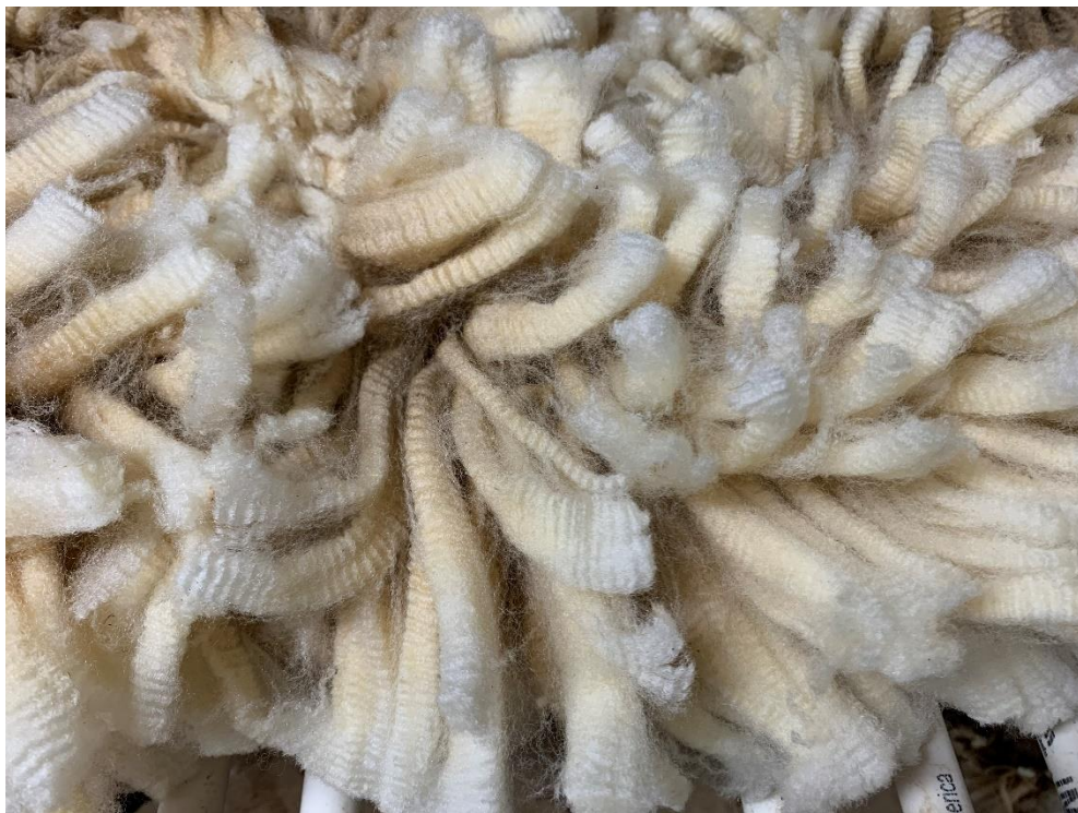
View of cut side of Bianca's fleece. (Continued on next page)