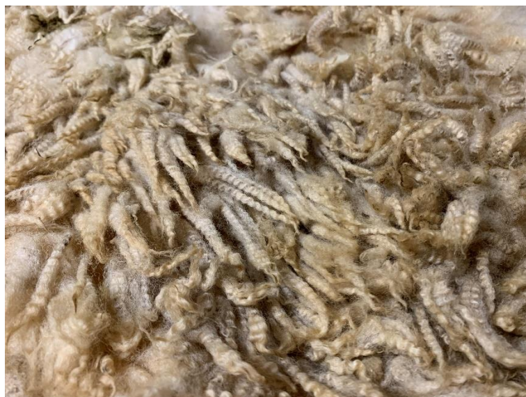
Above: view of front quarter of Bianca’s fleece. (Continued on next page)