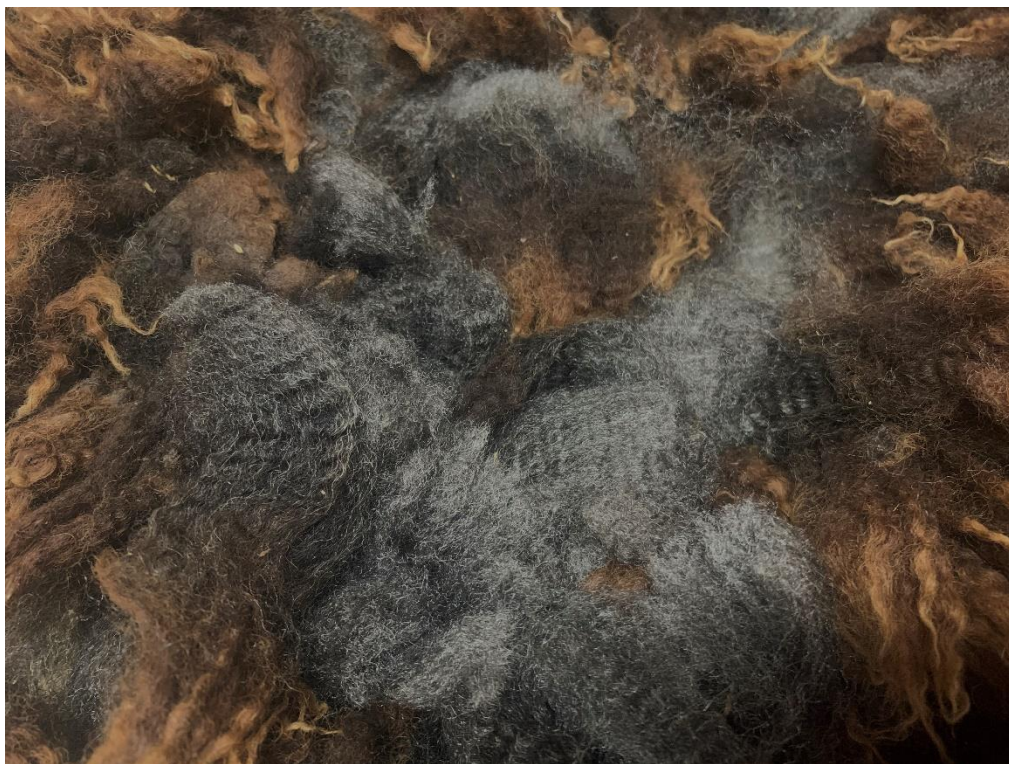
Above: view of rear quarters of Luna's fleece