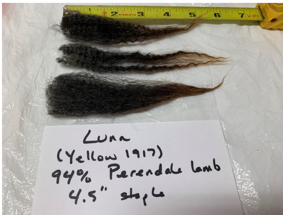
Same three locks after brief washing in tepid water with goat's milk soap.