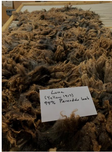
Above: overview of Luna's fleece, from head towards rear quarters.

Luna is a 94% pure Perendale yearling, "natural colored" (black). Her fleece is the second-lightest of our NC lamb fleeces, being a medium-dark gray, lighter at the cut end. The color fades to cream at the tips, and is darker at the front of the fleece than at the rear. Luna's fleece has some muddy tips, thanks to the fact that we had to pull the lambs off our hayfield early during the winter of 2019-2020, owing to the absence of fall rains/fall "flush" of grass growth. The mud washes off easily, fortunately. Luna's fleece has a staple length of 4.5" (unstretched). It has somewhat more VM than is average for our lamb fleeces, especially in the neck area. It weighs 3.6 pounds. Note: exposure of each photo has been adjusted in an attempt to match color as shown in photo to actual color.