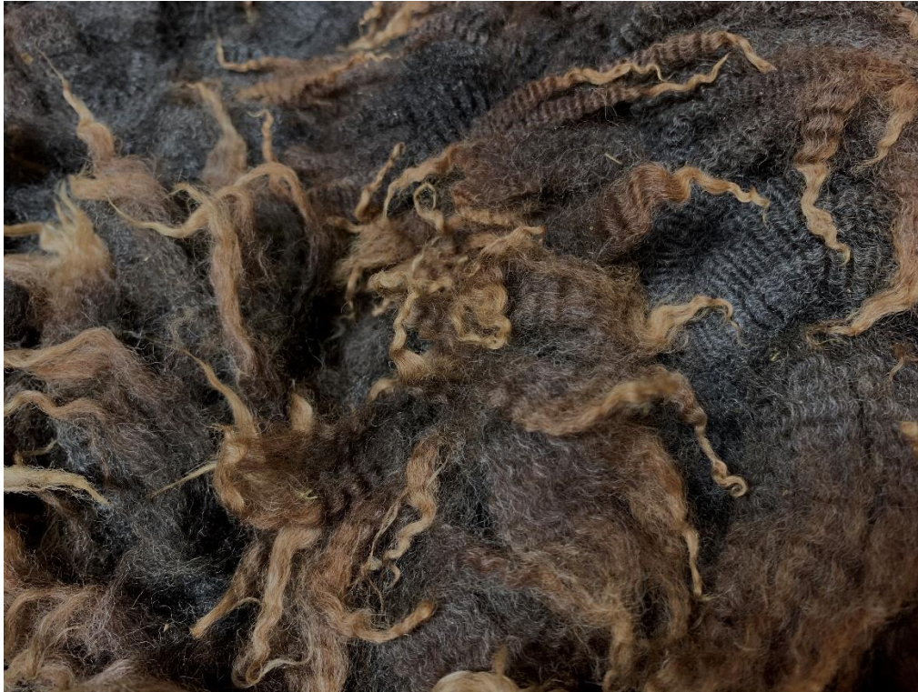
Above: view of middle of Luna's fleece