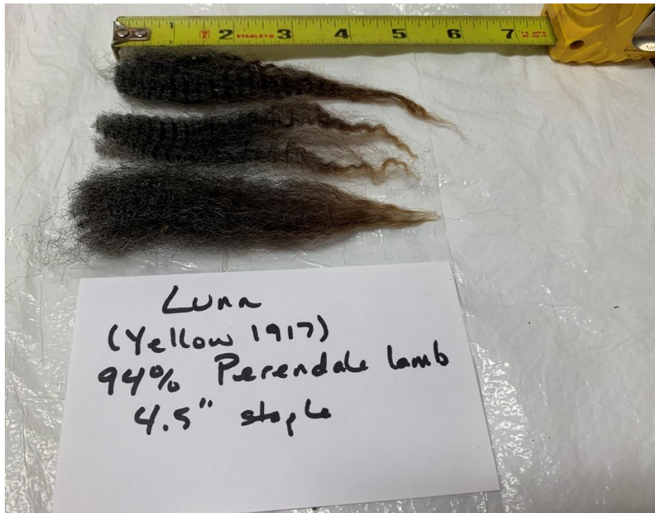
Above: three locks of Luna's fleece, taken at random from (top to bottom) front, middle, and rear quarters. All locks tested sound.