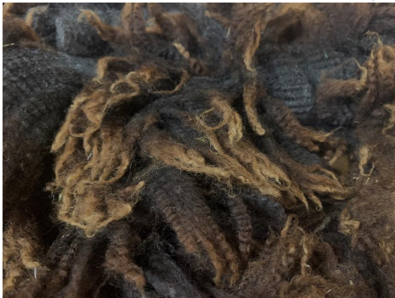
Above: view of front quarter of Hermione's fleece (Continued on next page)