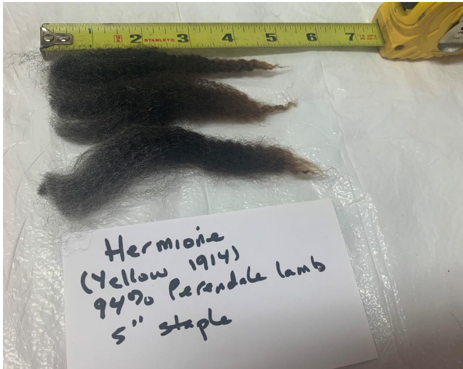
Above: three locks of Hermione's fleece, taken at random from (top to bottom) front, middle, and rear quarters. All locks tested sound.