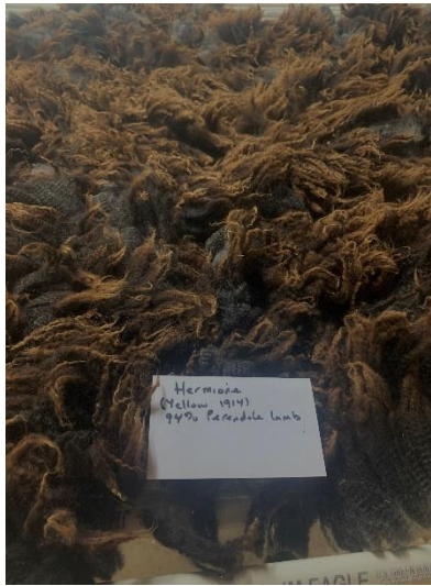
Above: overview of Hermione's fleece, from head towards rear quarters.

Hermione is a 94% pure Perendale yearling, "natural colored" (black). This fleece is a medium-dark gray, lighter at the cut end, as Hermione clearly wishes to become a gray ("English blue") ewe as she matures. The color fades to reddish tips. I can only imagine how lovely a heathered appearance yarn spun from her fleece will be. Hermione's fleece has some muddy tips, thanks to the fact that we had to pull the lambs off our hayfield early during the winter of 2019-2020, owing to the absence of fall rains/fall "flush" of grass growth. The mud washes off easily, fortunately. Hermione's fleece has a staple length of 5" (unstretched). It weighs 4.0 pounds. Note: exposure of each photo has been adjusted in an attempt to match color as shown in photo to actual color.