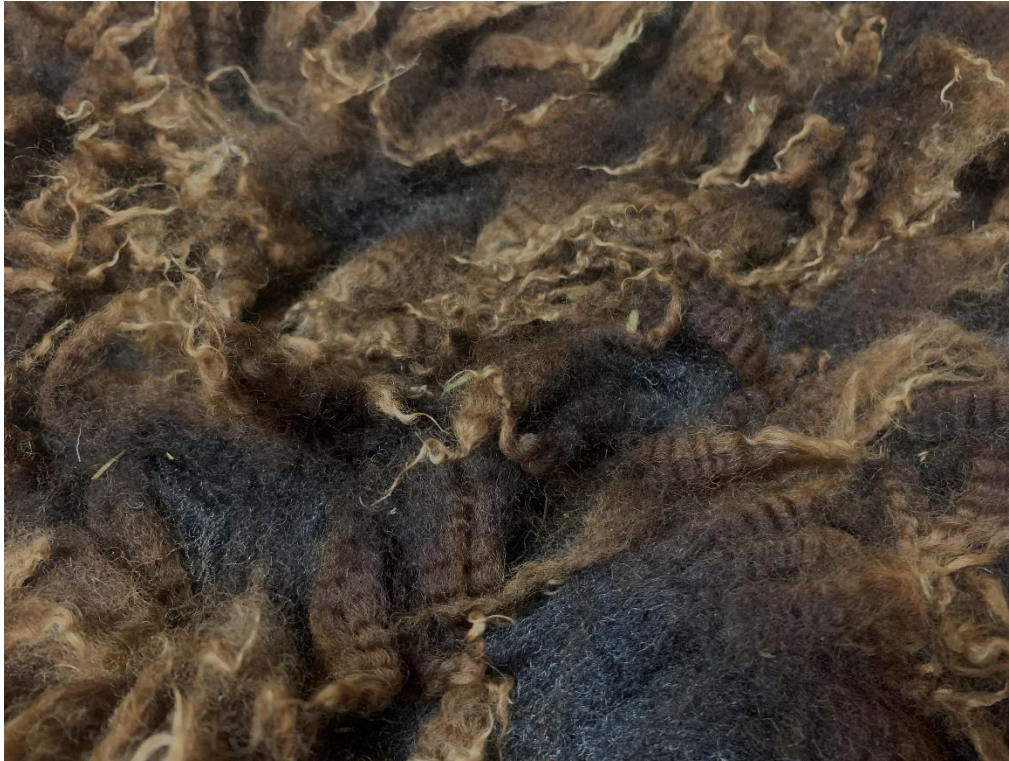
Above: view of middle of Hermione's fleece