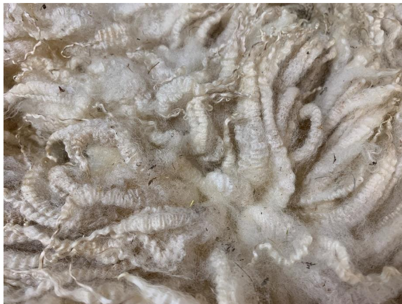
Above: view of front quarter of Minerva's fleece, where VM is most pronounced.