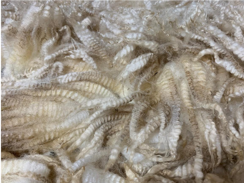
Above: view of middle of Minerva's fleece