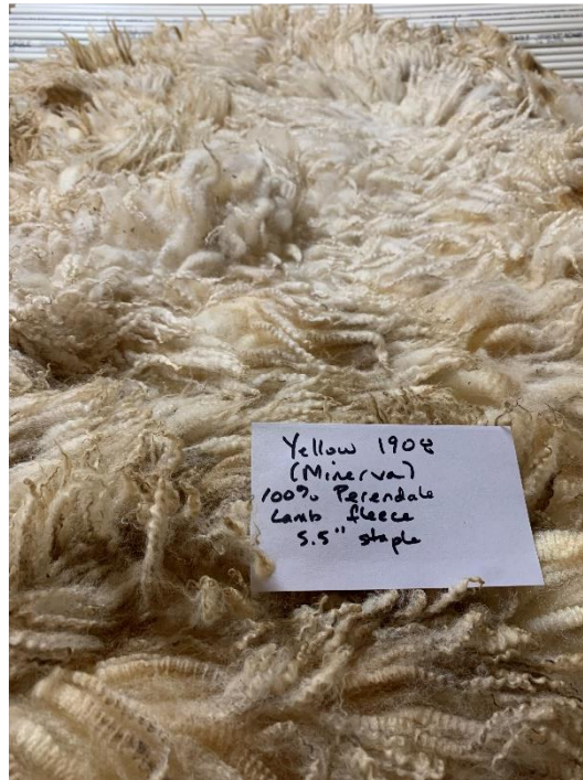
Above: overview of Minerva's fleece, from head towards rear quarters.

Minerva's fleece has an especially lovely crimp, very uniform throughout the fleece. It is also very soft, with minor VM most pronounced in the neck area. Despite the VM, I view it as this year's nicest white lamb fleece. Minerva's fleece has a 5.5" staple and weighs 3.2 pounds.