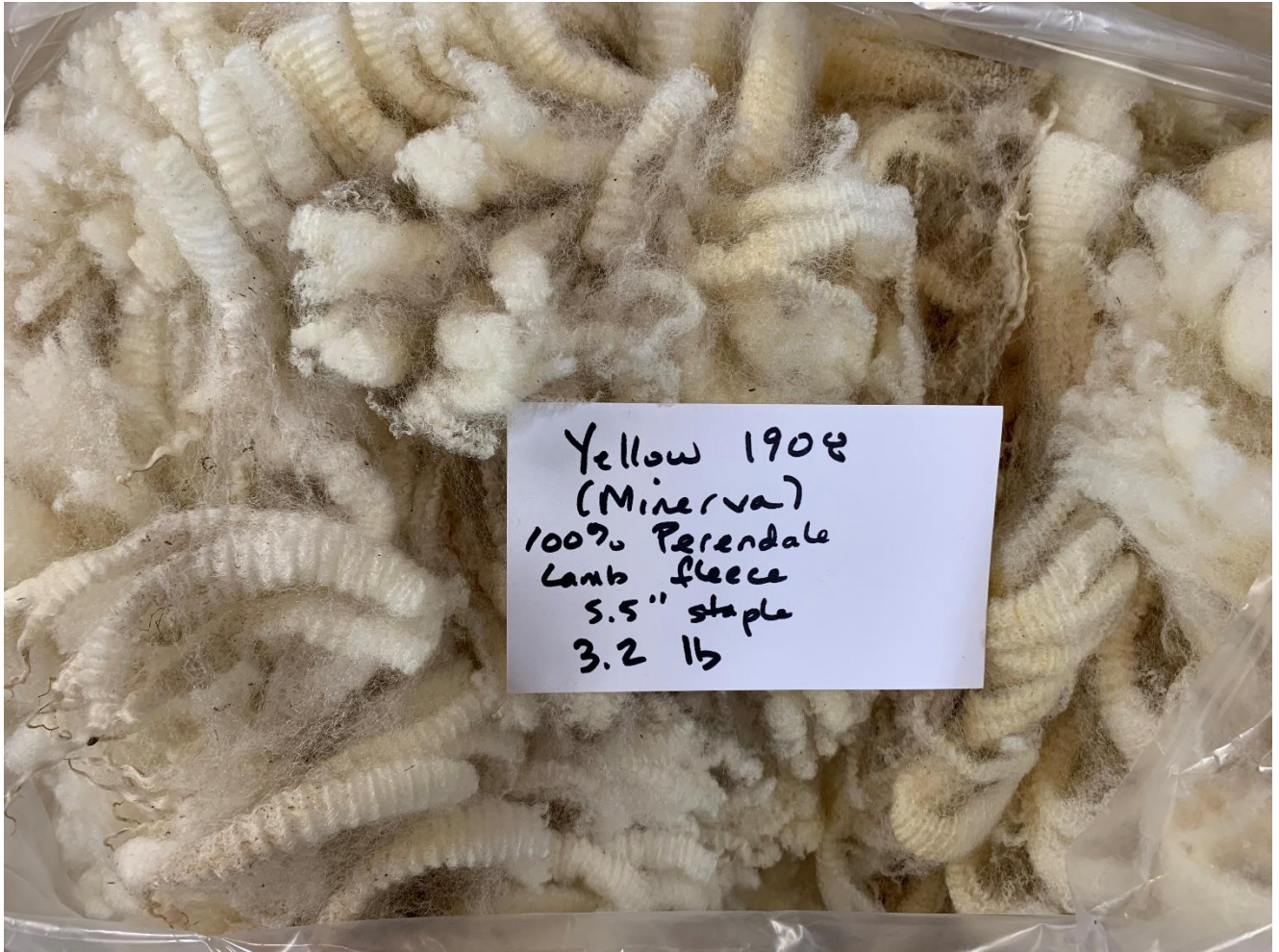
View of Minerva's fleece, as bagged.