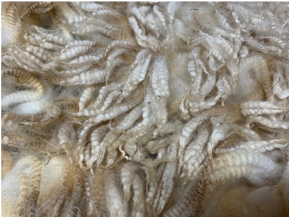
Above: view of rear quarter of Minerva's fleece (Continued on next page)