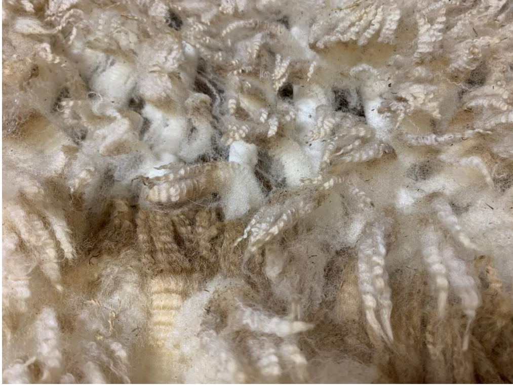
Above: view of middle of James' fleece