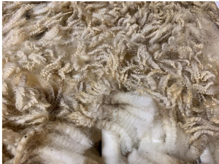
Above: view of front quarter of James' fleece, where VM is most pronounced.