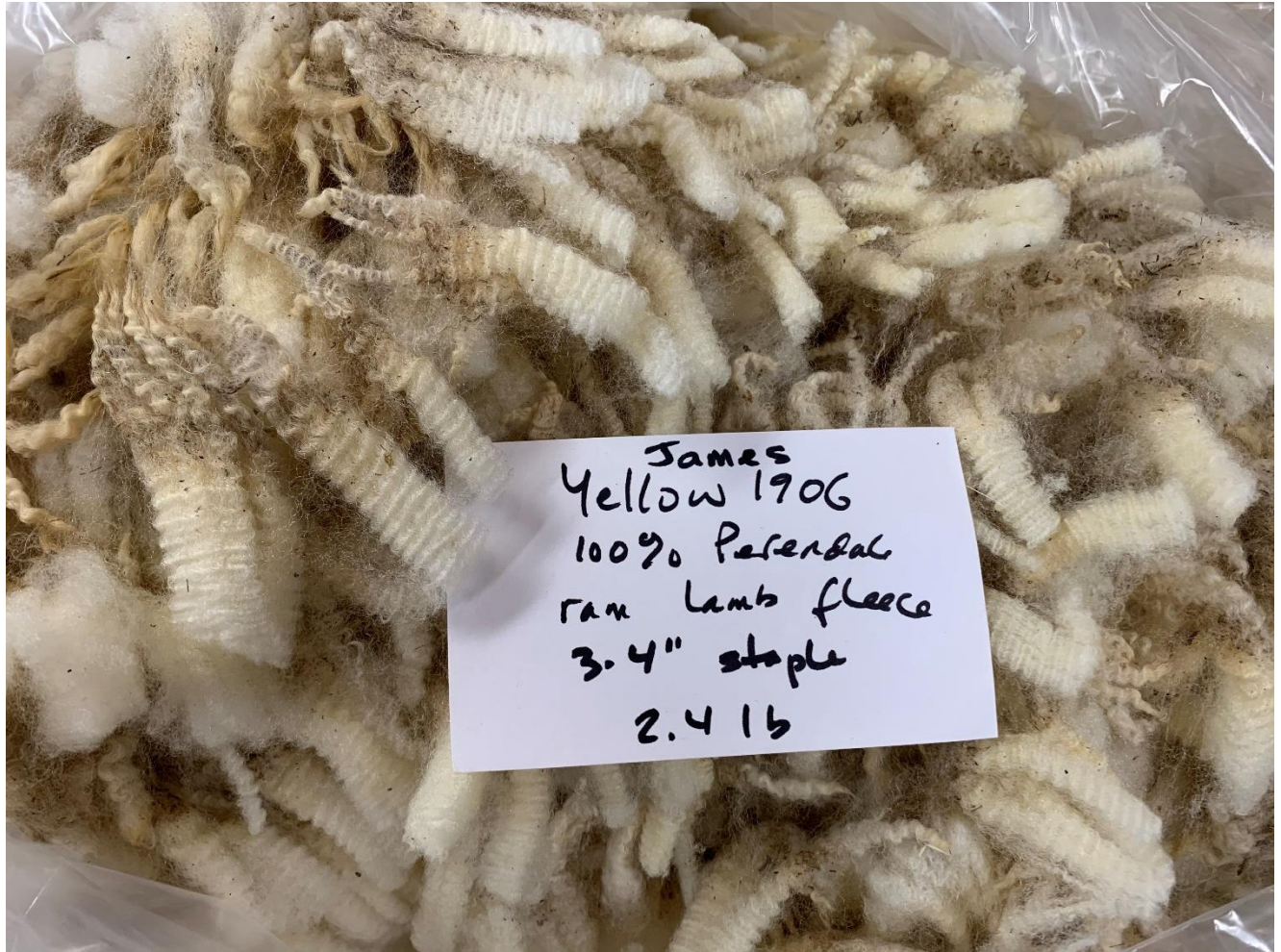
View of James' fleece, as bagged.