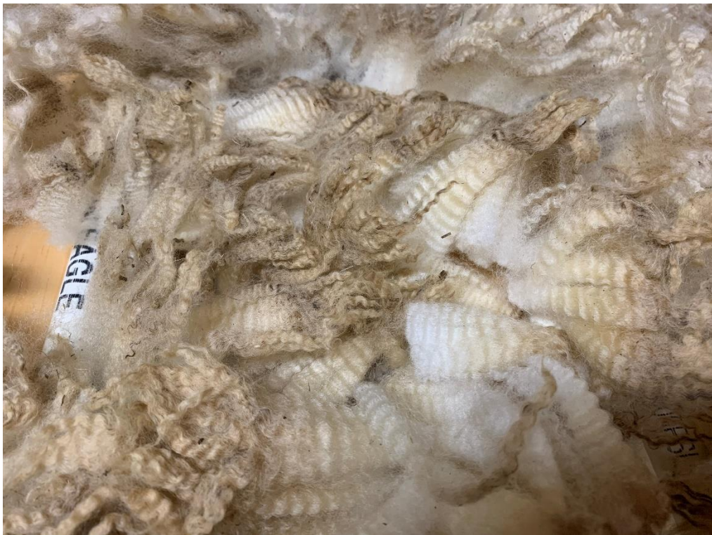
Above: view of rear quarter of James' fleece (Continued on next page)