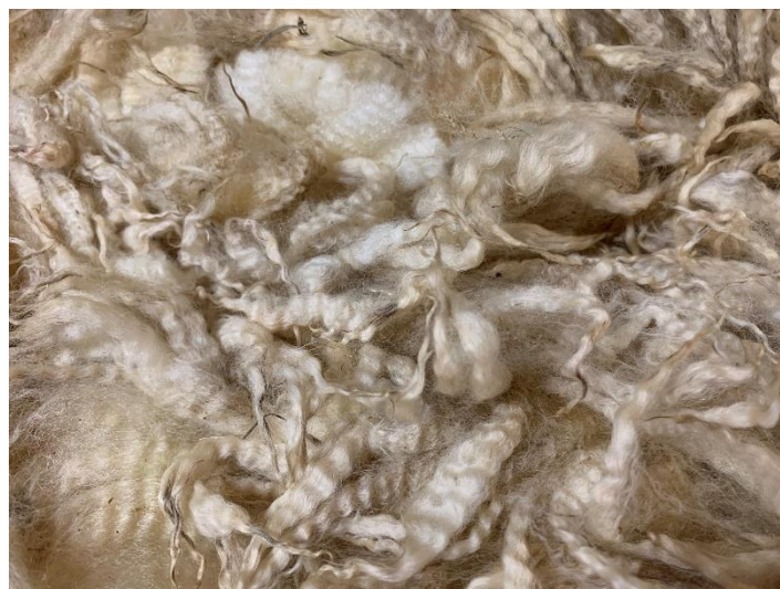
Above: view of front quarter of April's fleece.