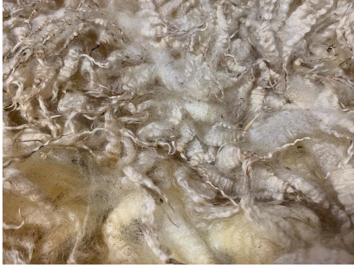
Above: view of middle of April's fleece