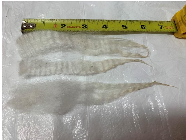
Same three locks after brief washing in tepid water with goat's milk soap.