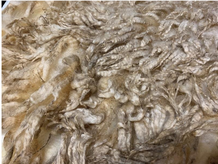
Above: view of rear quarter of April's fleece