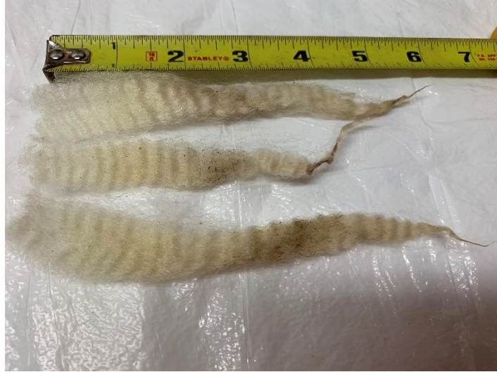
Above: three locks of April's fleece, taken at random from (top to bottom) front, middle, and rear quarters. All locks tested sound.