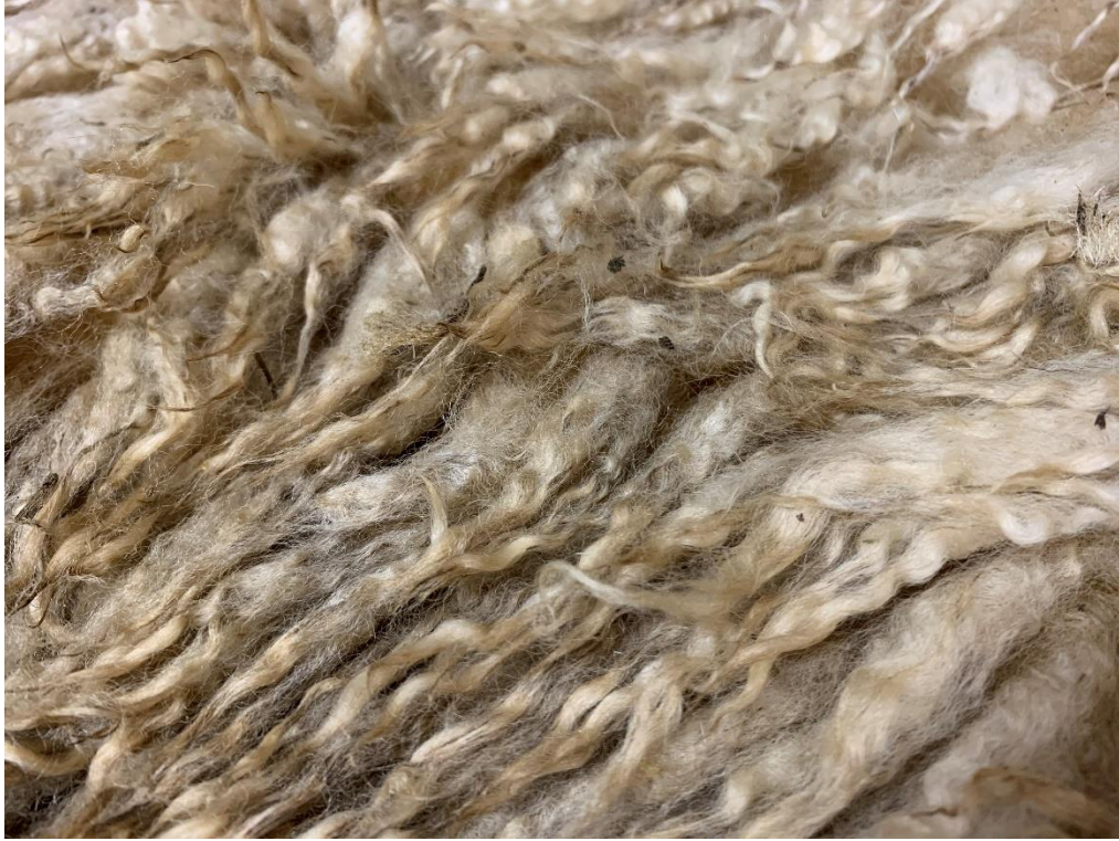
Above: view of middle of Ginny's fleece