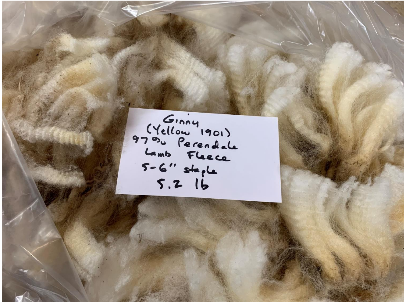
View of Ginny's fleece, as bagged.