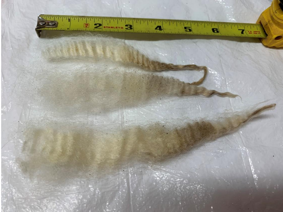
Above: three locks of Ginny's fleece, taken at random from (top to bottom) front, middle, and rear quarters. All locks tested sound.