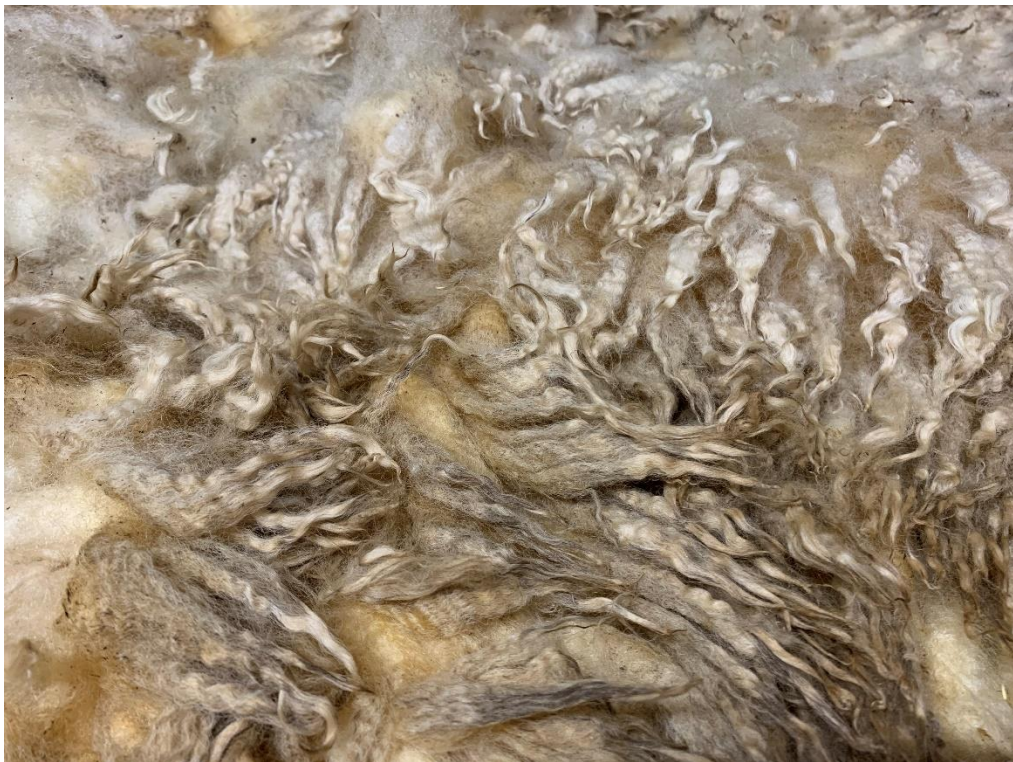
Above: view of rear quarter of Ginny's fleece (Continued on next page)