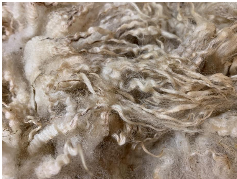
Above: view of front quarter of Ginny's fleece.