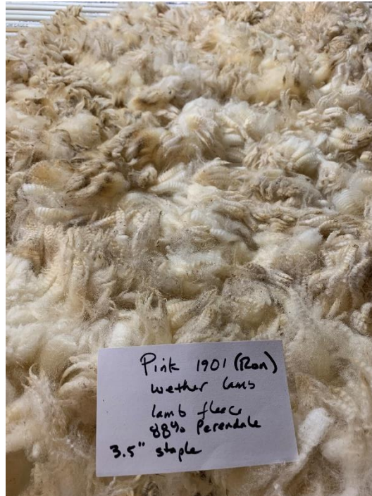
Above: overview of Ron's fleece, from head towards rear quarters.

Why do wethers (who can't pass their genetics on) always have such nice fleeces? Ron was shorn as a baby to help avoid the stress of our hot summers, so this represents 7 months of growth. It has a very nice and quite uniform crimp, and yet is very soft. Ron's fleece has a 3.5" staple and weighs 3.4 pounds. Because its staple is shorter, it is not holding together as well as the longer ewe lamb fleeces.