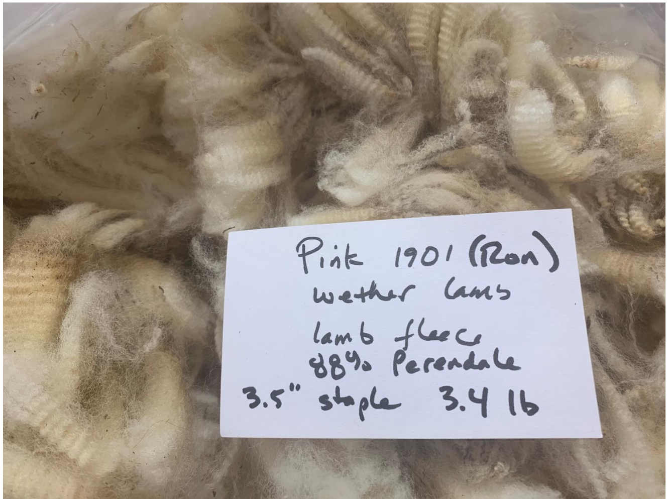
View of Ron's fleece, as bagged.