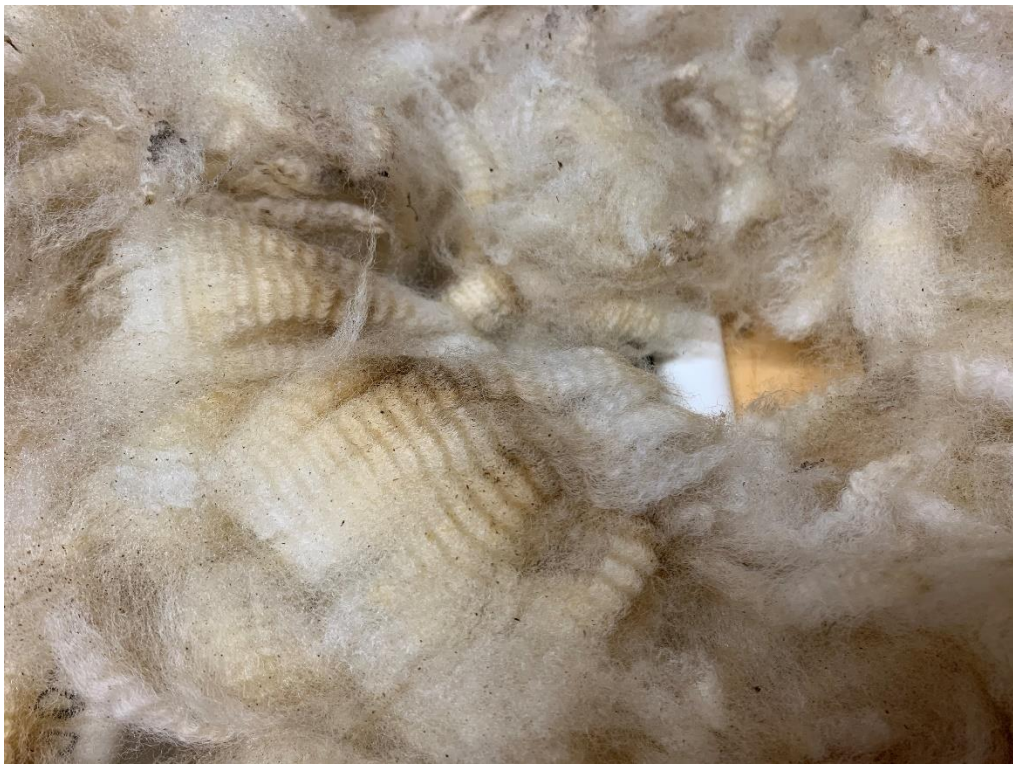
Above: view of rear quarter of Ron's fleece (Continued on next page)