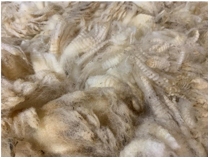
Above: view of front quarter of Ron's fleece.