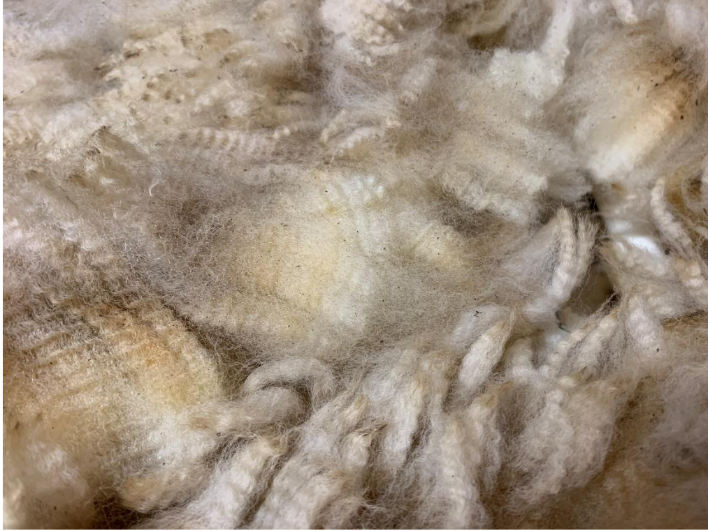
Above: view of middle of Ron's fleece