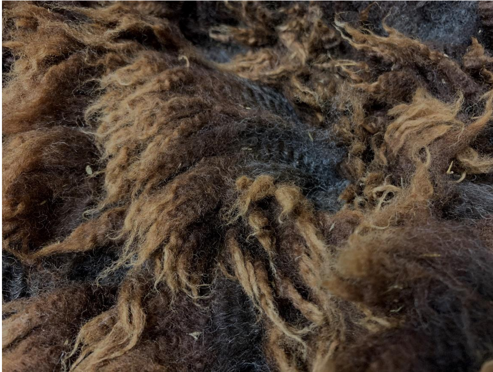
Above: view of middle of Cora's fleece