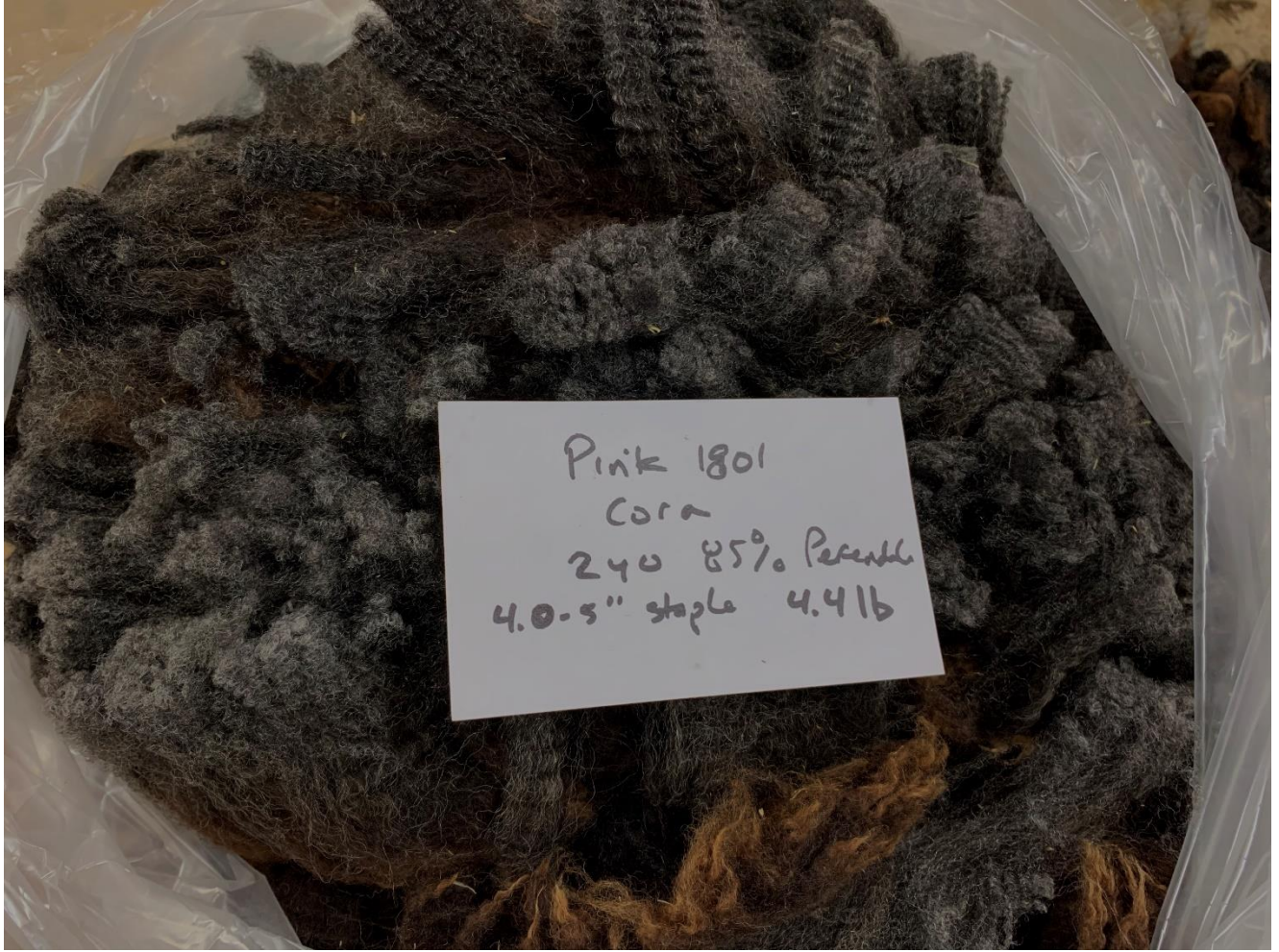
View of Cora's fleece, as bagged.