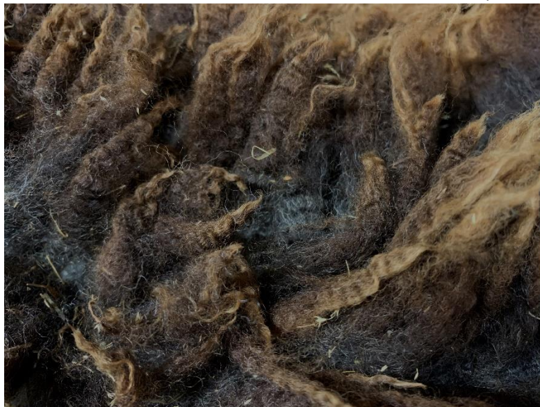
Above: view of front quarter of Cora's fleece. Note VM. (Continued on next page)