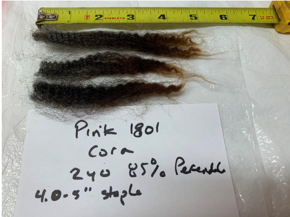
Above: three locks of Cora's fleece, taken at random from (top to bottom) front, middle, and rear quarters. All locks tested sound.