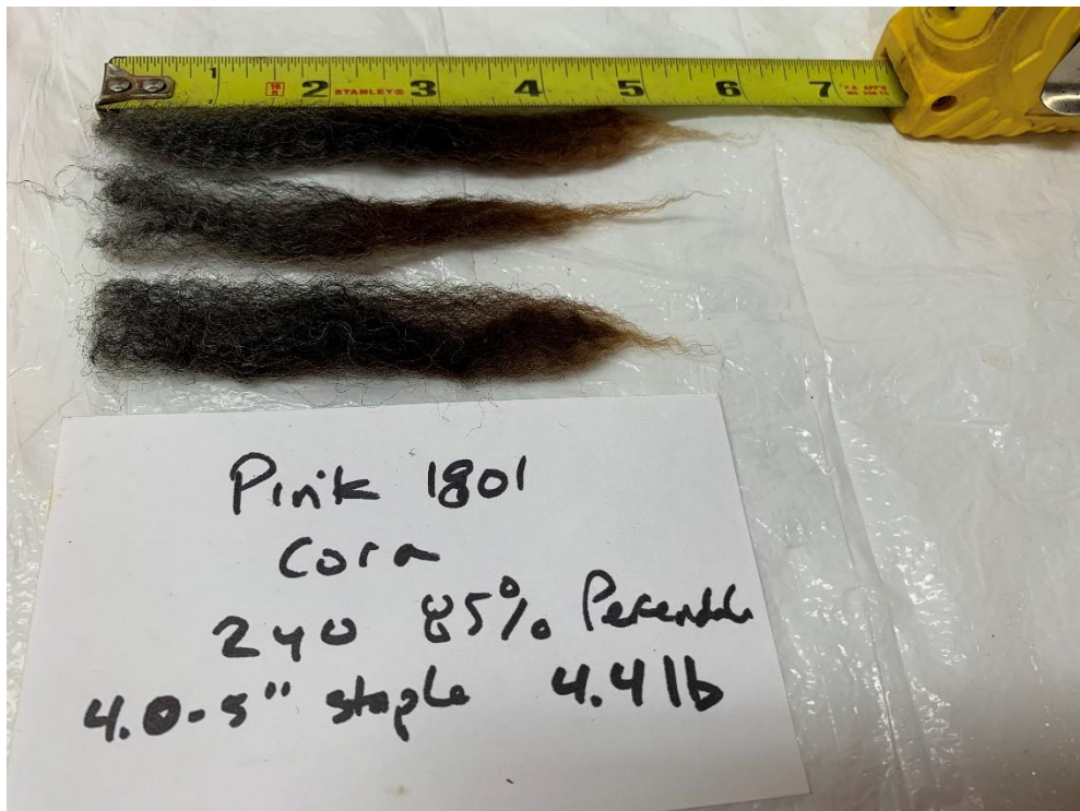
Same three locks after brief washing in tepid water with goat's milk soap.